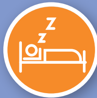
Feeling very tired all the time, more than is normal for you