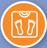
Unexplained weight loss