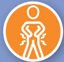
Bone or back pain that you can't explain and that doesn't go away

Don't be scared Don't delay Call your GP today