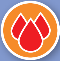
Blood in your urine

Call your GP TODAY if you notice any of the following