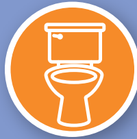
Passing urine more often or with difficulty